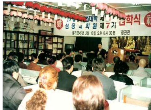
First Lecture Room