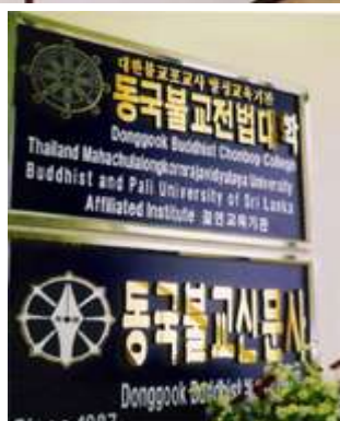
College Signboard & Entrance