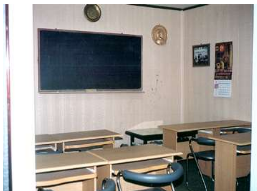
The Fourth Lecture Hall