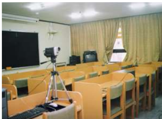
The Second Lecture Hall