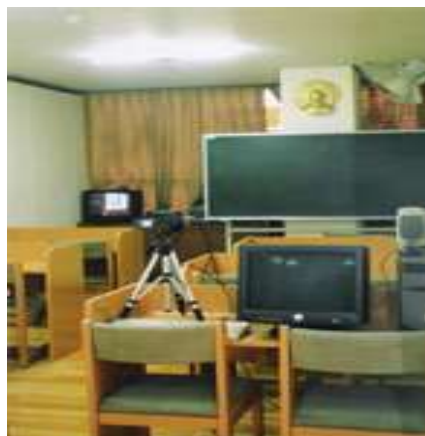
The Third Lecture Hall