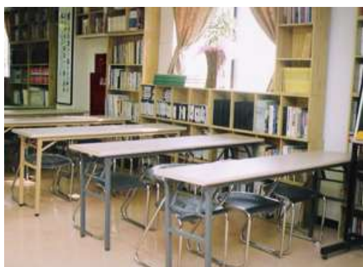
The Fourth Lecture Hall