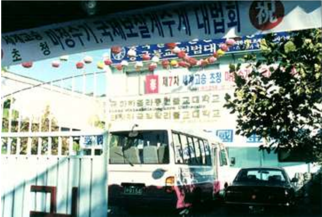
The Front View of Beomcheon-dong Campus (First Campus)