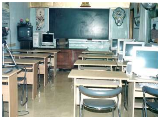
The Second Lecture Hall