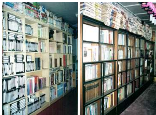
Library and Reference Book