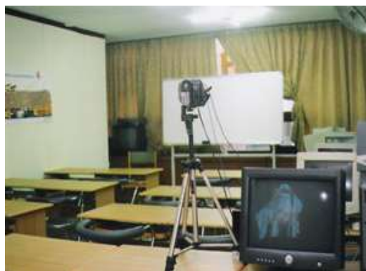
The First Lecture Hall