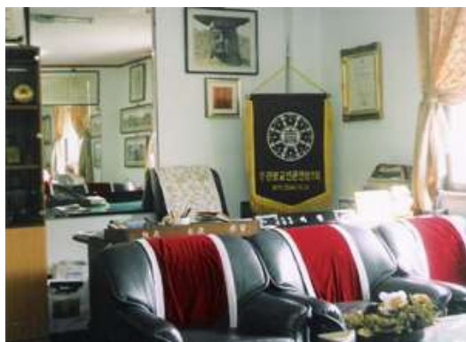
The Chairman room