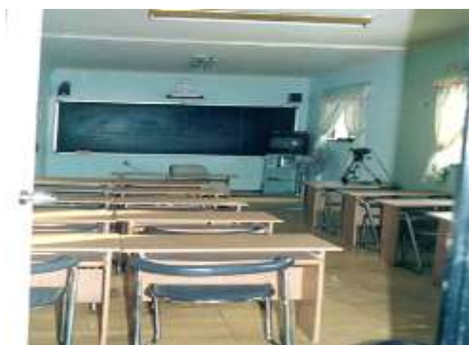
The Third Lecture Hall