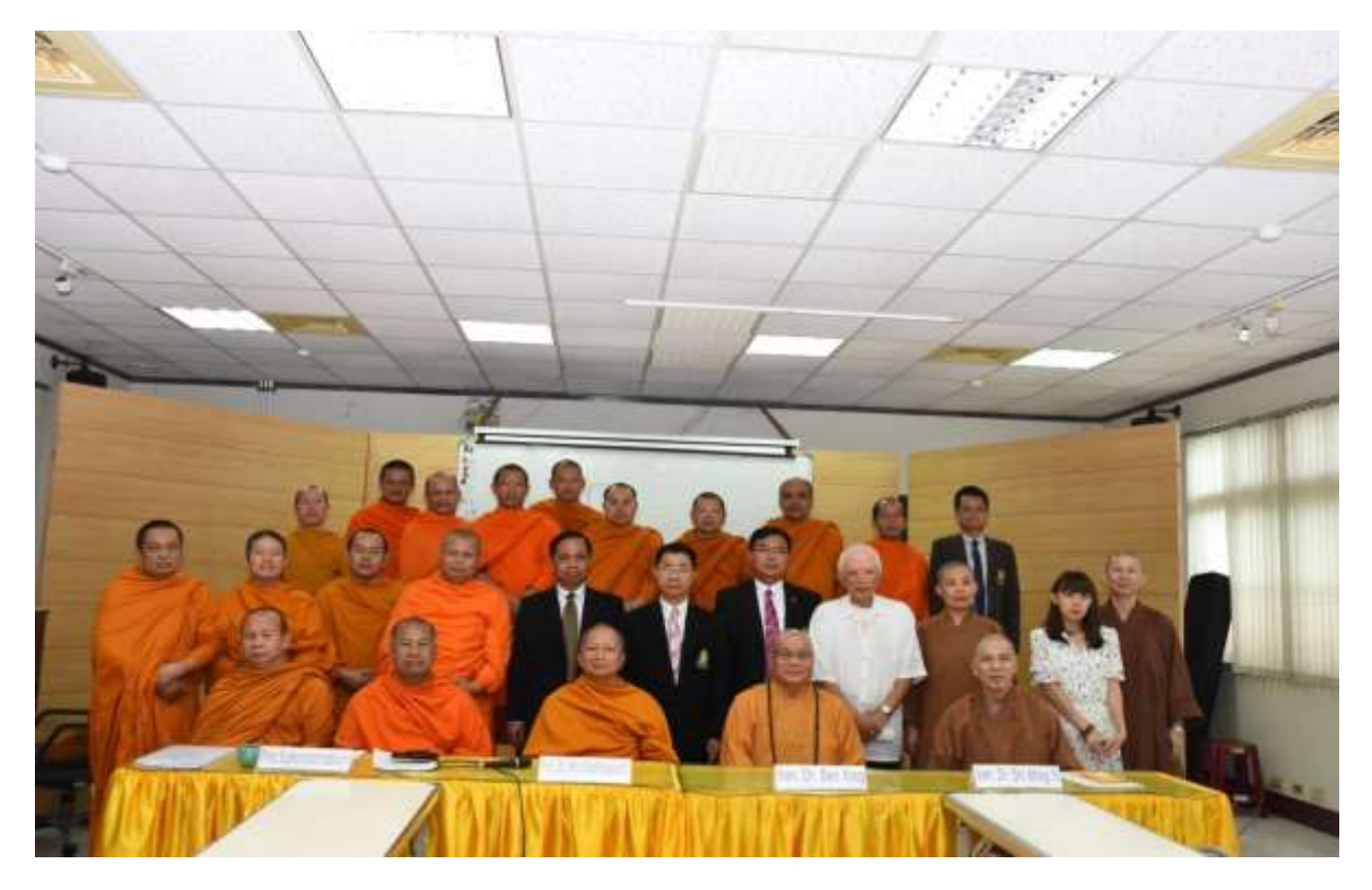
Group Photo after Ending of Affiliation Committee Meeting