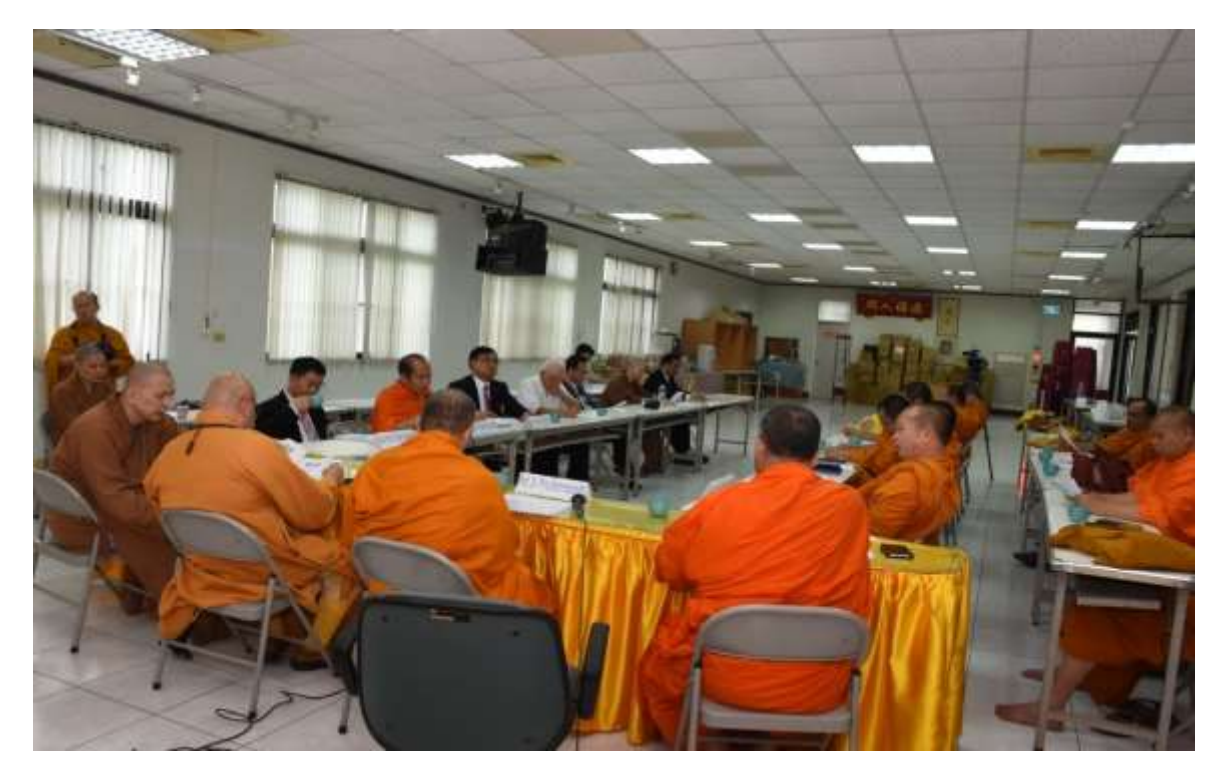
Members of Affiliation Committee