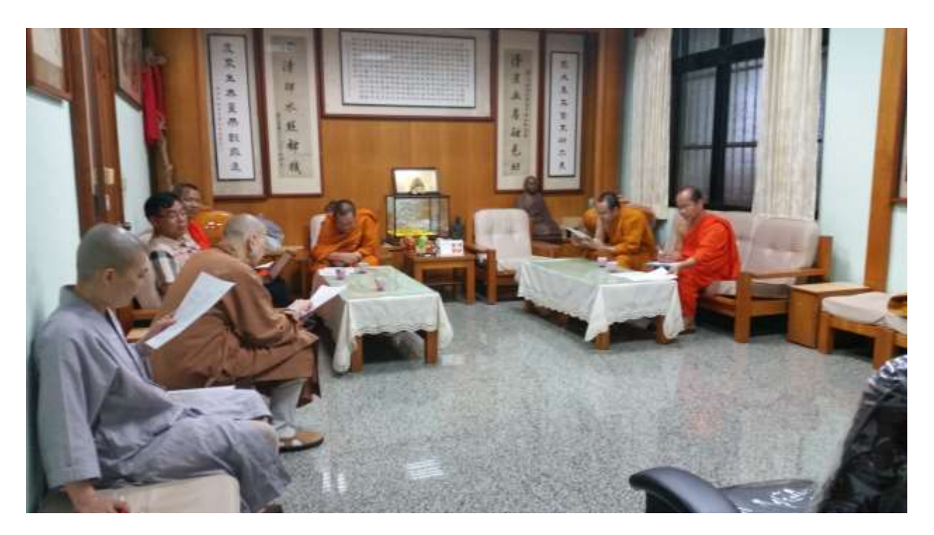
Progressing Internal Quality Assurance Meeting