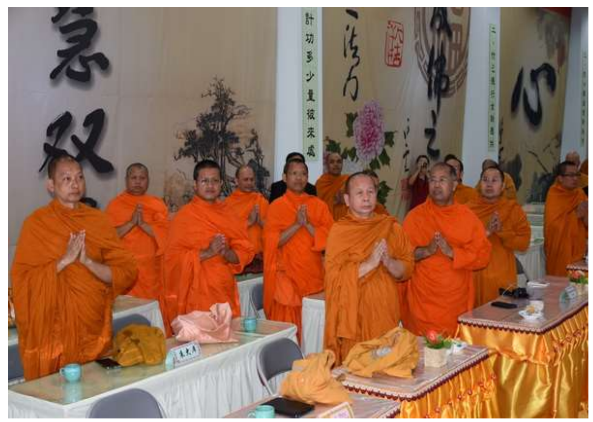
Attending Graduation Ceremony